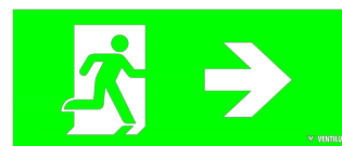
Right Arrow PN: 01754