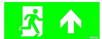
Up Arrow (both sides) PN: LPSTISO04MVL

Additional options of Printed Panels available. Contact Ventilux for further details.