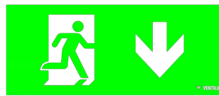
Down Arrow (both sides) PN: LPVGDISO02VL