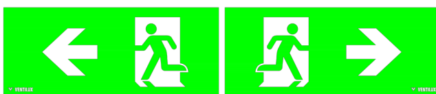
Left /Right Arrow (Left one side, Right opposite side) PN: LPVGDISO013VL