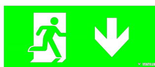
02 for application of Down Arrow