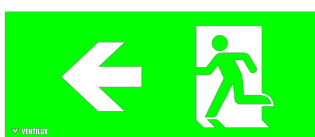
01 for application of Left Arrow