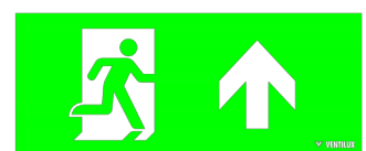
04 for application of Up Arrow