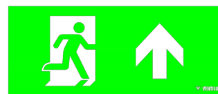
04 for application of Up Arrow